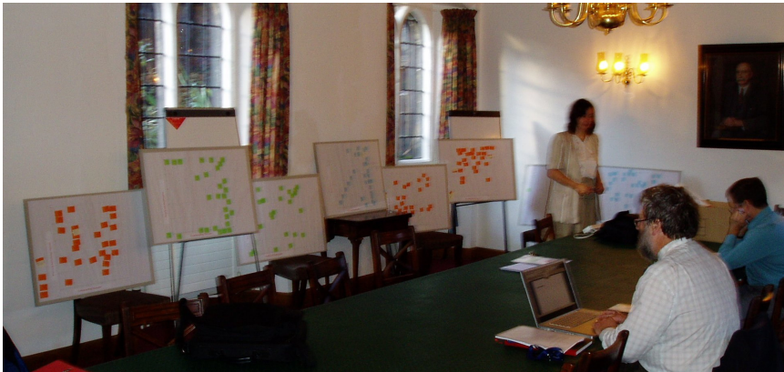
Figure 2: Display of the 2D representations of the Five Key Issues and thirty-nine classes

visual aid during discussions in terms of the relative importance of the various classes relating to the five key areas. Examples of the classes along with samples of their component comments, ideas and issues are given in Table 1.